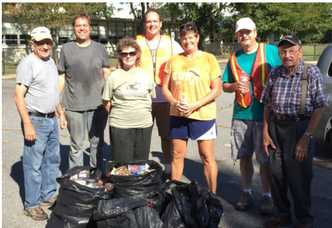
What a good looking crew! The neighborhood's quarterly Adopt-a-Spot cleanup was held on Saturday Sept. 19th, providing litter pickup along Thole Street, Galveston Blvd., and the Suburban Acres Elementary School property.