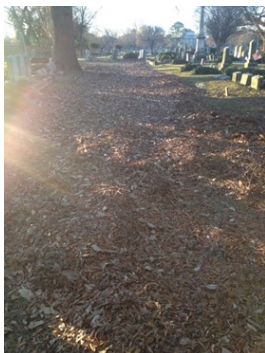
Before and after work crew clean up Elmwood Cemetery in Norfolk

During the holidays, many families and friends visit local cemeteries to beautify graves of loved ones with festive holiday embellishments. In Norfolk, the NSO deputies supervised inmate work crews recently to enhance the appearance of several cemeteries and public properties, primarily with leaf and brush removal. All of the before and after photos could fill an entire newsletter, but some of the projects where the crews made a significant impact were St. Mary's Cemetery (450 bags of leaves), West Point Cemetery (134 bags of leaves), and Elmwood Cemetery (clean up of cemetery grounds). They also collected 43 bags of leaves at the Police Operations Center and cleared brush and leaves at the Vo Tech. Great job Community Corrections!!