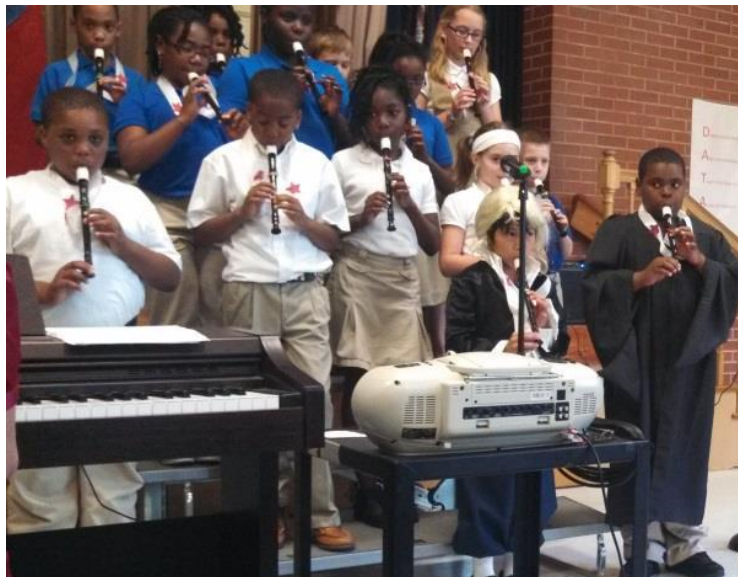
The Fourth Grade Recorders perform at Suburban Park Elementary's Spring Program on April 16th. More photos on page 4.