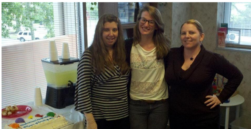
Staff members at Wards Corner Chiropractic celebrate the office's 25th anniversary at Wards Corner, and most recent Virginian Pilot "Best of" award in May.