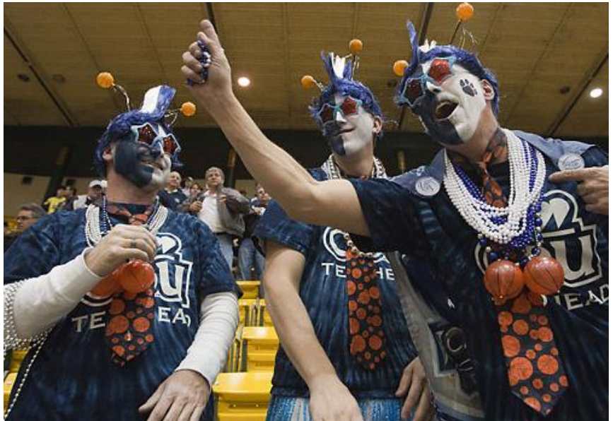
The "TedHeads" will appear in this year's Suburban Acres July 4th Parade.

The hallmark of Suburban Acres' parade is neighborhood participation. The neighborhood usually doesn't disappoint with various family marching units and floats, and bike riders with bicycles decorated with patriotic themes. This year prizes will be awarded for family and youth marching units and floats.