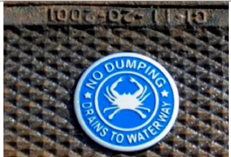
20 of these blue crab-themed awareness medallions were installed on neighborhood storm drains by volunteers in May.

SACL had 70 points going into Saturday May 26 th when a neighborhood group installed pollution-reminding medallions on 20 storm drains in the Suburban Park and Wards Corner/ Cromwell Parkway portion of the neighborhood. The medallion installation is worth 15 points in the EARNN rebate program, including 10 bonus points for youth involvement (three