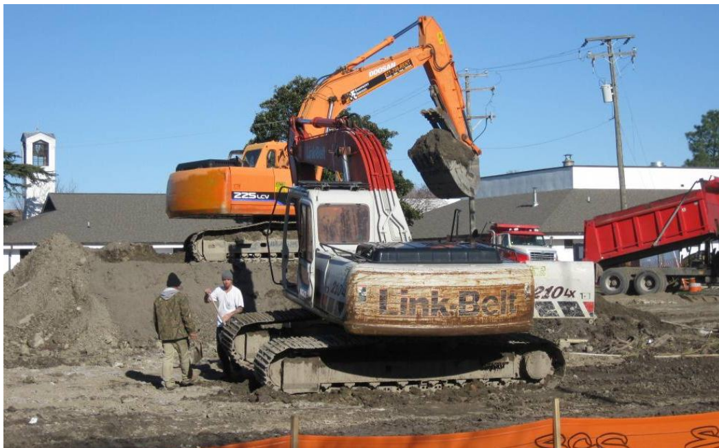
Workers perform site preparation for Norfolk Collegiate's new arts center on Granby Street property adjacent to Norfolk Collegiate's Upper School; until December 5th the site held an old medical office building.