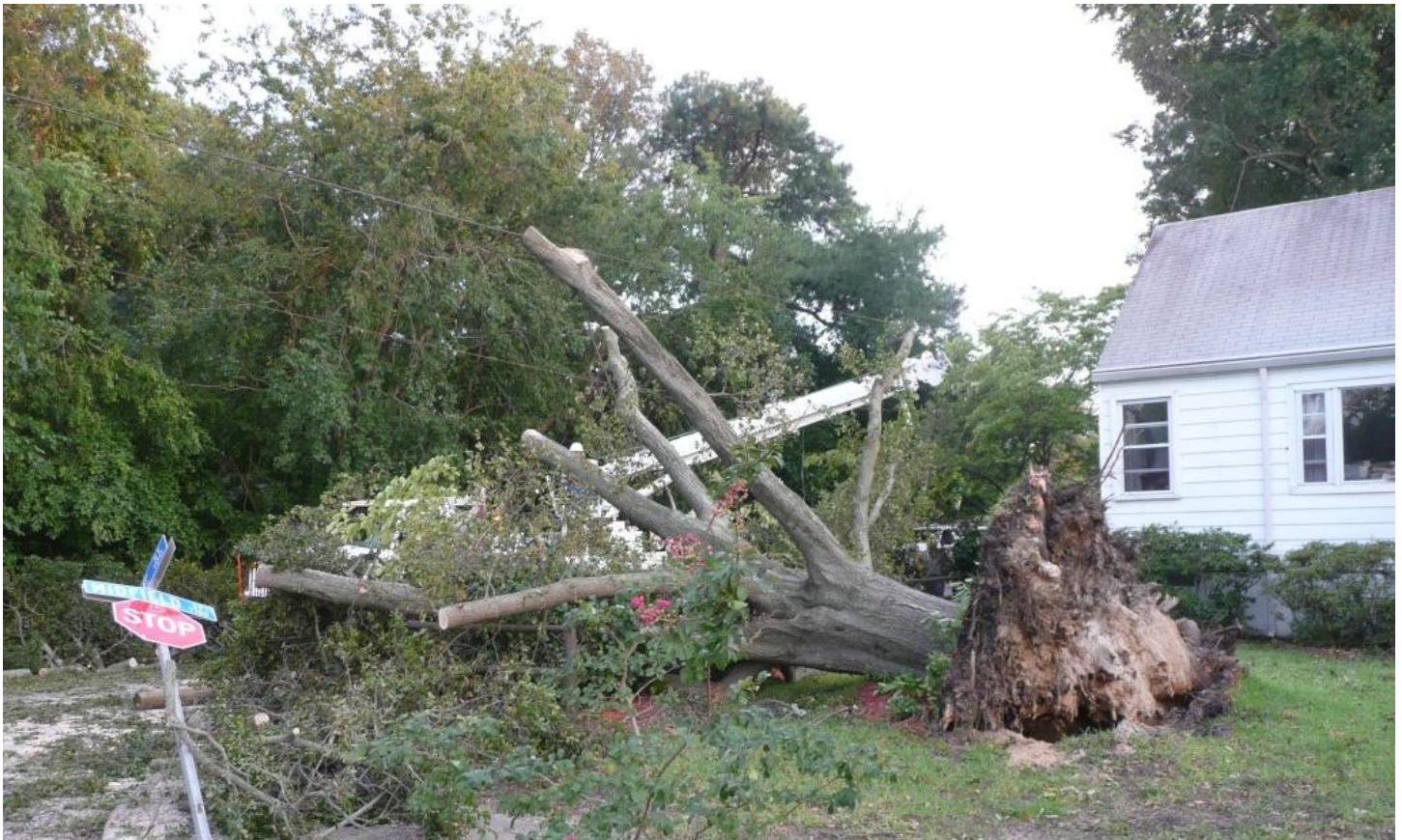
Hurricane Irene's winds and water caused this damage at a home at the intersection of Fife and Midfield on August 27th.