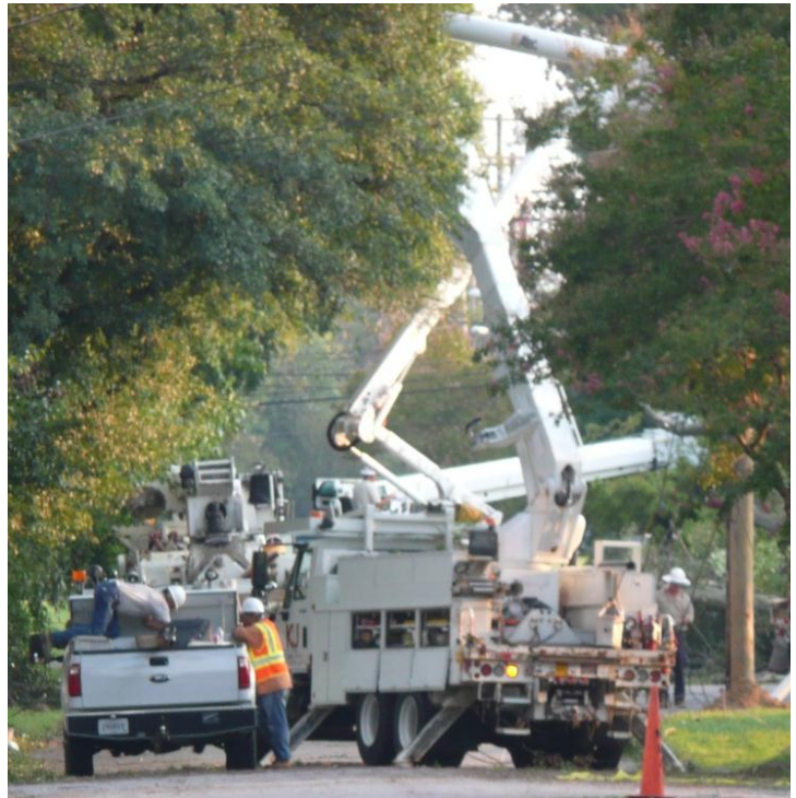
Kentucky power crews repair power lines in the Chelsea / Granby Park area after Hurricane Irene.