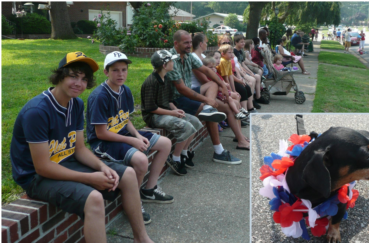
Neighbors (two- and four-legged) enjoy the sixth annual Suburban Acres Independence Day Parade on Monday July 4th.