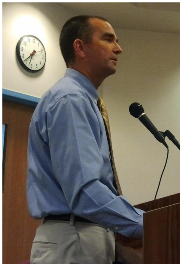
State Senator Ralph Northam spoke at the July 11 SACL meeting.