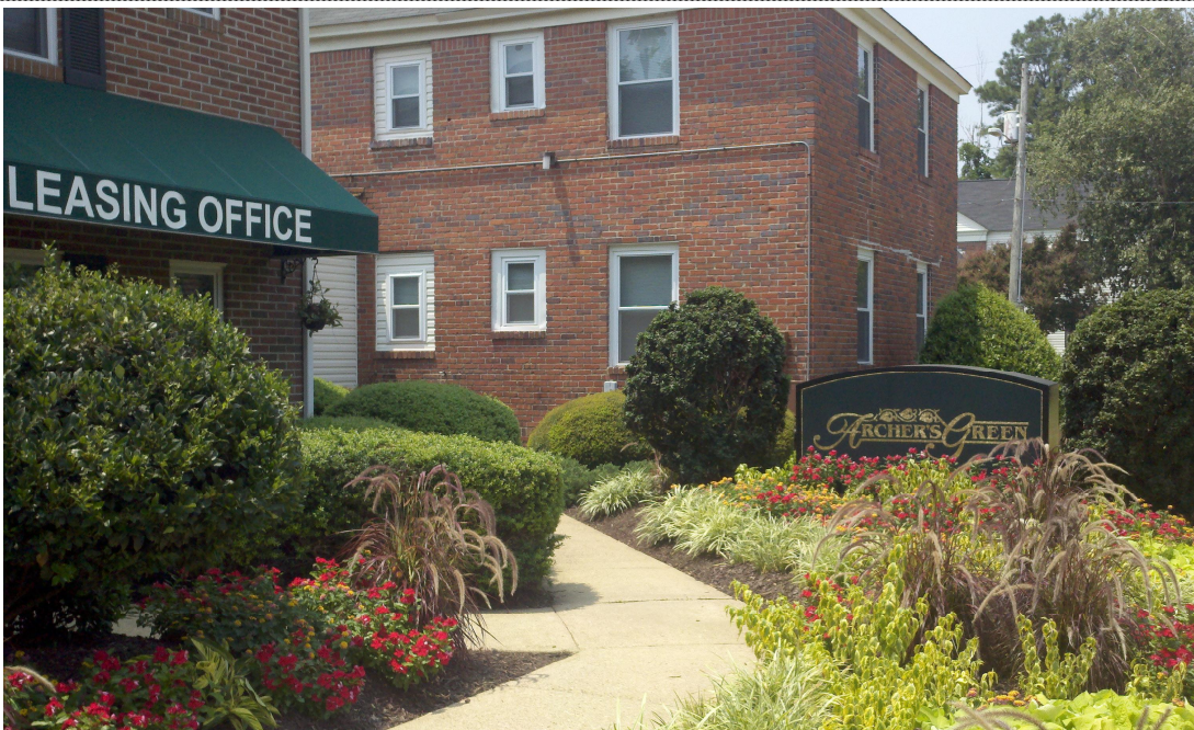
The Archer's Green community is employing a new landscaping company this year.