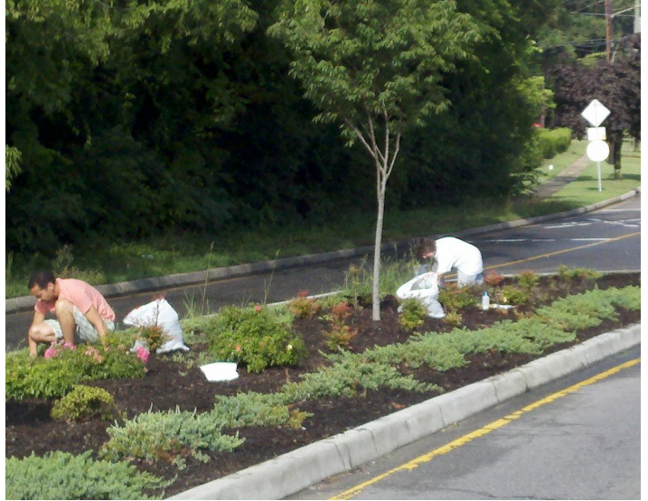
Neighbors spruce up Thole Street medians on July 9th

After EARNN's organization, Suburban Acres Civic League was the first community group to win the maximum $750 cash award in fiscal year 2010. In this past fiscal year 2011's competition the neighborhood fell short of earning maximum points, but still received enough points for a $450 cash prize from the city.