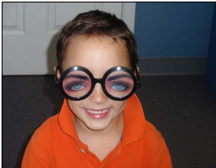
The eyes have it at the SACL Harvest Celebration.